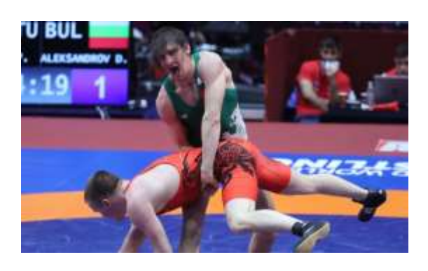
Task 3. During the first minute of the first part of the wrestling match, if the competitor is put in a bottom (parter) position due to passive wrestling, the latter needs to perform the correct defense so that he/she does not lose technical points.

Task 2. During the first part of the wrestling match, by means of active technical and tactical moves, getting the right to put the opponent in a bottom (parter) position is sought in order to earn technical points first.