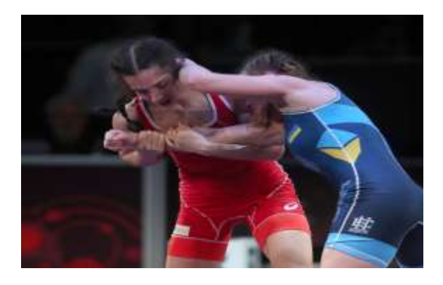
Task 6 . During the first minute of the second part of the wrestling match, by correctly positioning the body, make the opponent break the rules and thus earn points for negative wrestling.