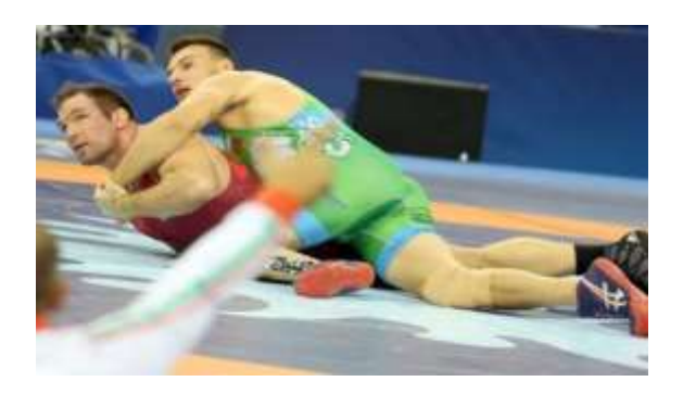
Task 4. During the second minute of the first part of the wrestling match, by means of powerful physical action, the opponent needs to be forced to step outside the wrestling area, so a point is earned this way.