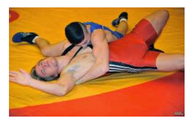
Task 10 . During the third minute of the second part of the wrestling match, the wrestling match is conducted in the center of the wrestling area with correctly imposing a grip.