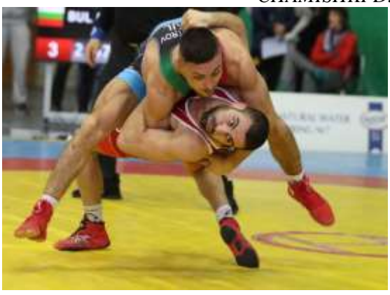
Task 9. During the third minute of the second part of the wrestling match, in the case of a negative score, the wrestler risks and seeks a flawless victory by pinning the opponent.