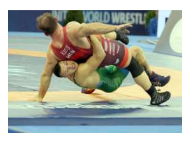
Task 8. During the second minute of the second part of the wrestling match, in the case of a negative score, a technical action of "throw over the chest" suplex is sought to be realized.