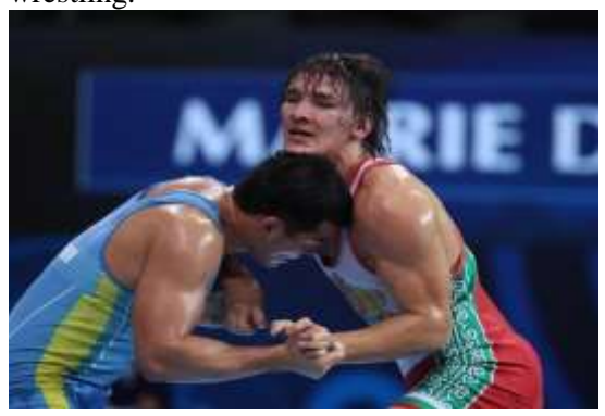
Task 7 . During the first minute of the second part of the wrestling match, after earning the right and putting the opponent in a bottom (parter) position, realize the technical action of bridging the opponent/.