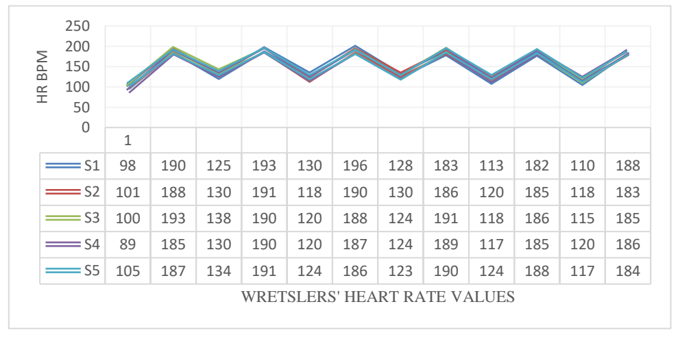
Figure 1. Athletes' heart rate values before and after each wrestling matches of the modeled training Trakia Journal of Sciences, Vol. 19, Suppl. 1, 2021

bpm for the S4 competitor and reach 138 bpm for the S3 competitor. During the simulated fights, the heart rate increased in all wrestlers and the highest values were registered in competitors S1 (196 bpm) after the third fight and in the same competitor after the second fight, as well as S3 after the first fight. The HR in the breaks between the matches had values from 89 to 138 bpm